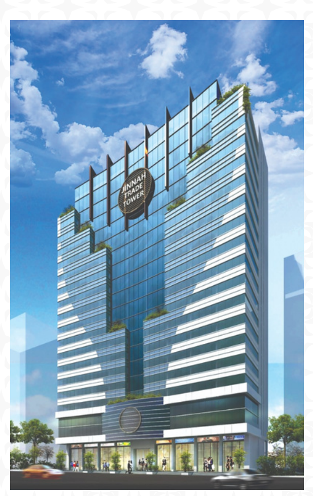
Jinnah Trade Center