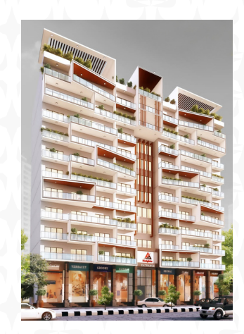
Athar Ammar Heights