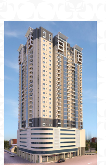
Athar Aman Castle